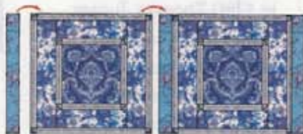
block row - make 2

Sew (3) 2-1/2" blue texture stripe squares, alternating with (2) 2-1/2" x 20-1/2" blue scallop leaf strips to make a sashing row. (Make 3 sashing rows.)