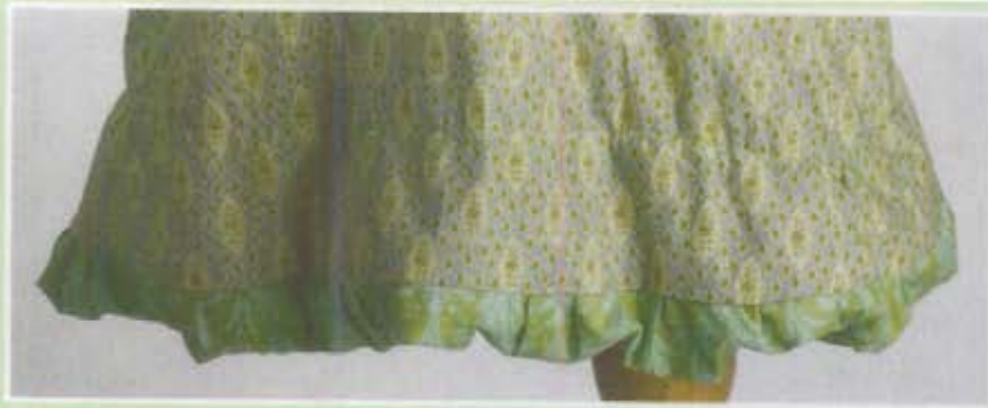
Photos show dress inside out. Notice how the bubble skirt is gathered to the skirt lining at the bottom edge and rolls upward slightly to the inside.